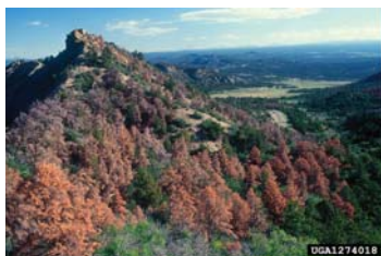
Bark Beetles of North America

www.forestpests.org Featuring USDA Forest Service Forest Health Protection Publications