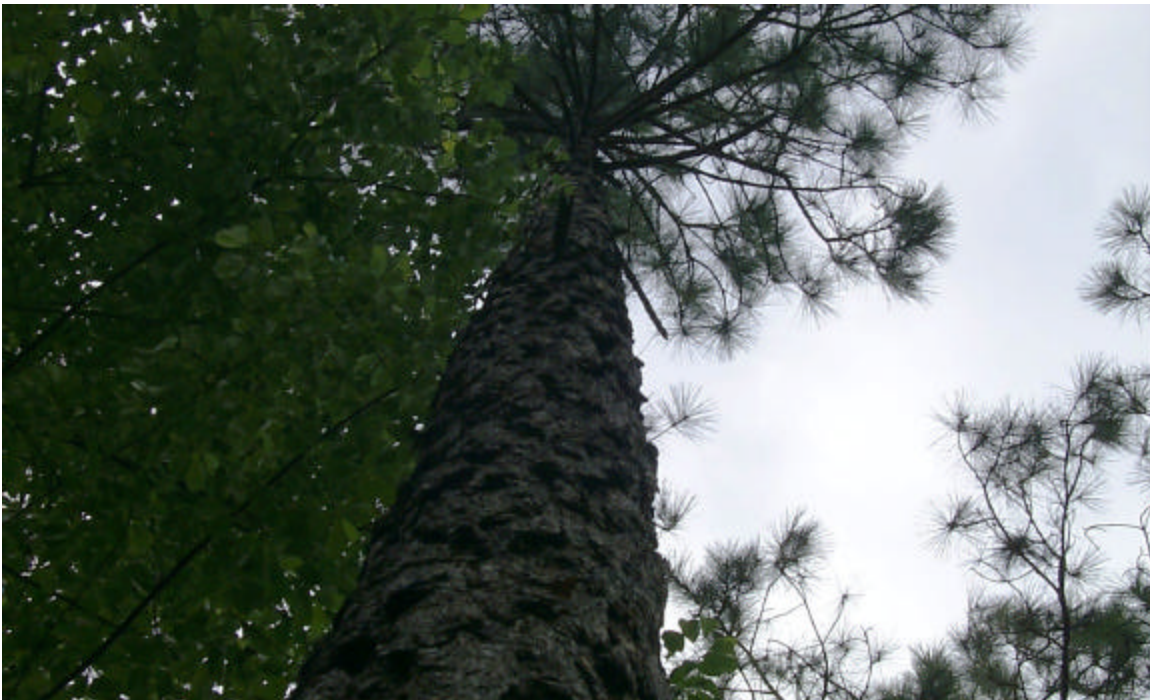
Photo 8. A potential pine pole with little sweep.