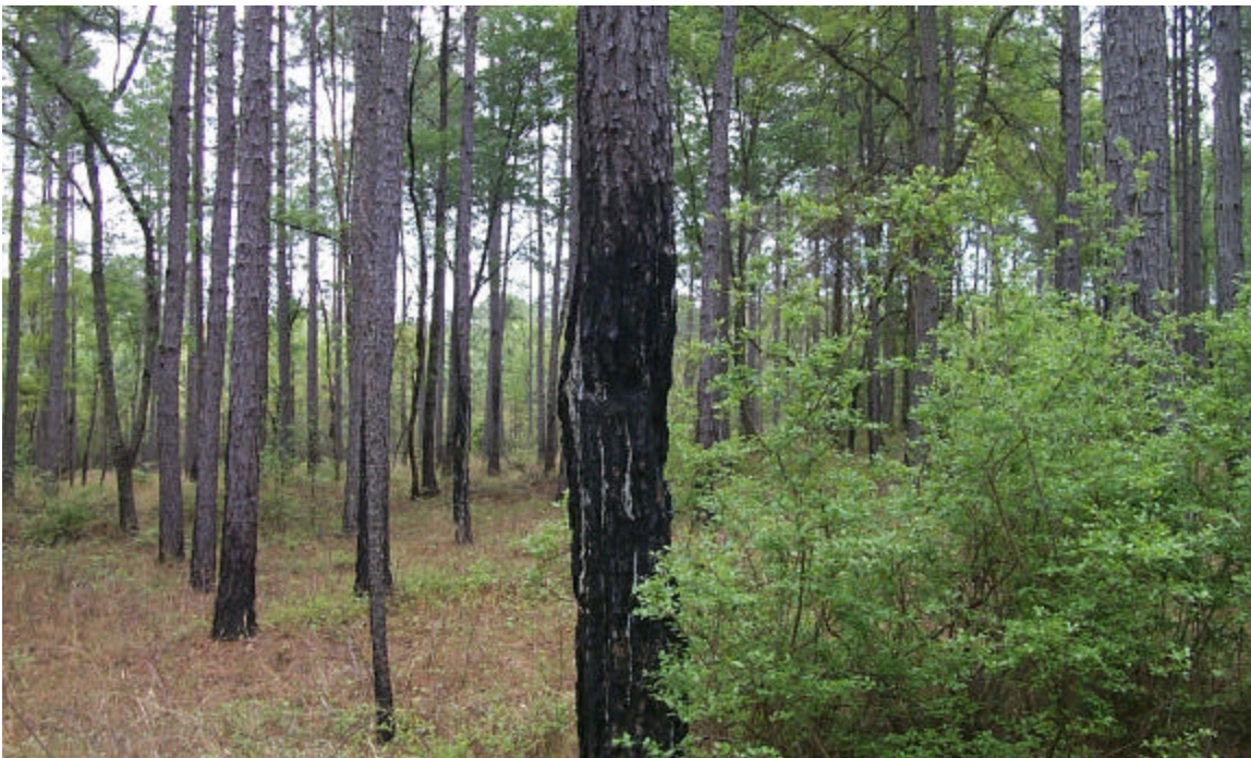
Photo 2. A managed slash pine stand (approximately 30-years-old) in Treutlen County, GA. The stand has been thinned with the objective of growing high valued sawtimber and poles. Note the stem cankered tree in the foreground that would need to be cut above the canker to possibly produce a pole. Note also the lack of branches the first 15 to 20 feet due to stand age, species, and management.