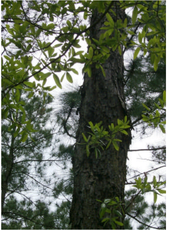
Photos 5 and 6. Examples of steep branch angle and a stem canker that would make that part of the stem not usable for a pole (stem below the steep branch or canker may qualify as a pole if there is enough length and no other defects).