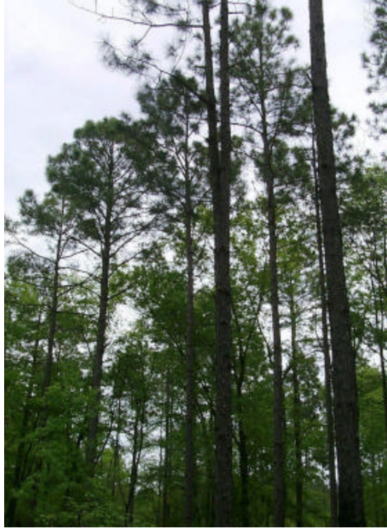
Photos 3 and 4. Examples of excessive sweep and a fork defect (stem up to fork could be used as a pole).