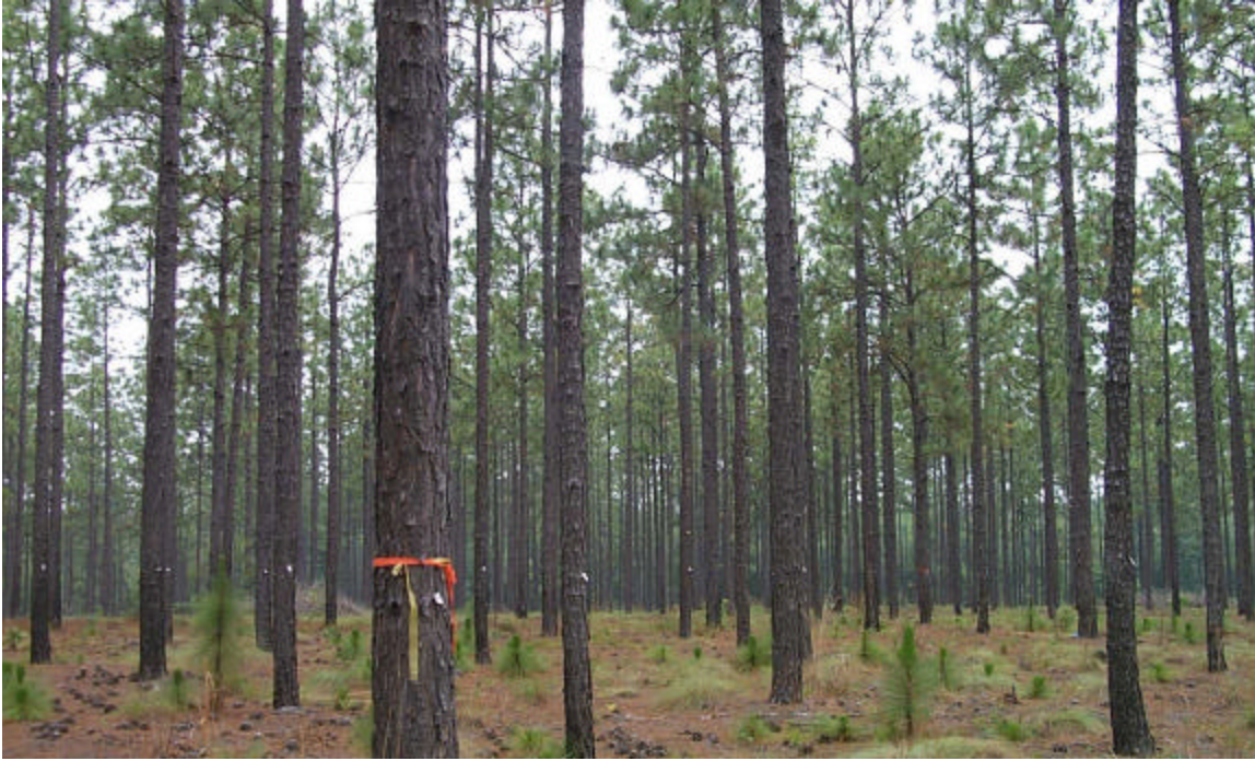
Photo 1. Longleaf stand (38-years-old) on the Sand Hills State Forest in Chesterfield County, SC, thinned twice growing on excessively well drained low fertility deep sand. Stand has been producing pine straw and is anticipated to produce some poles and quality sawtimber.