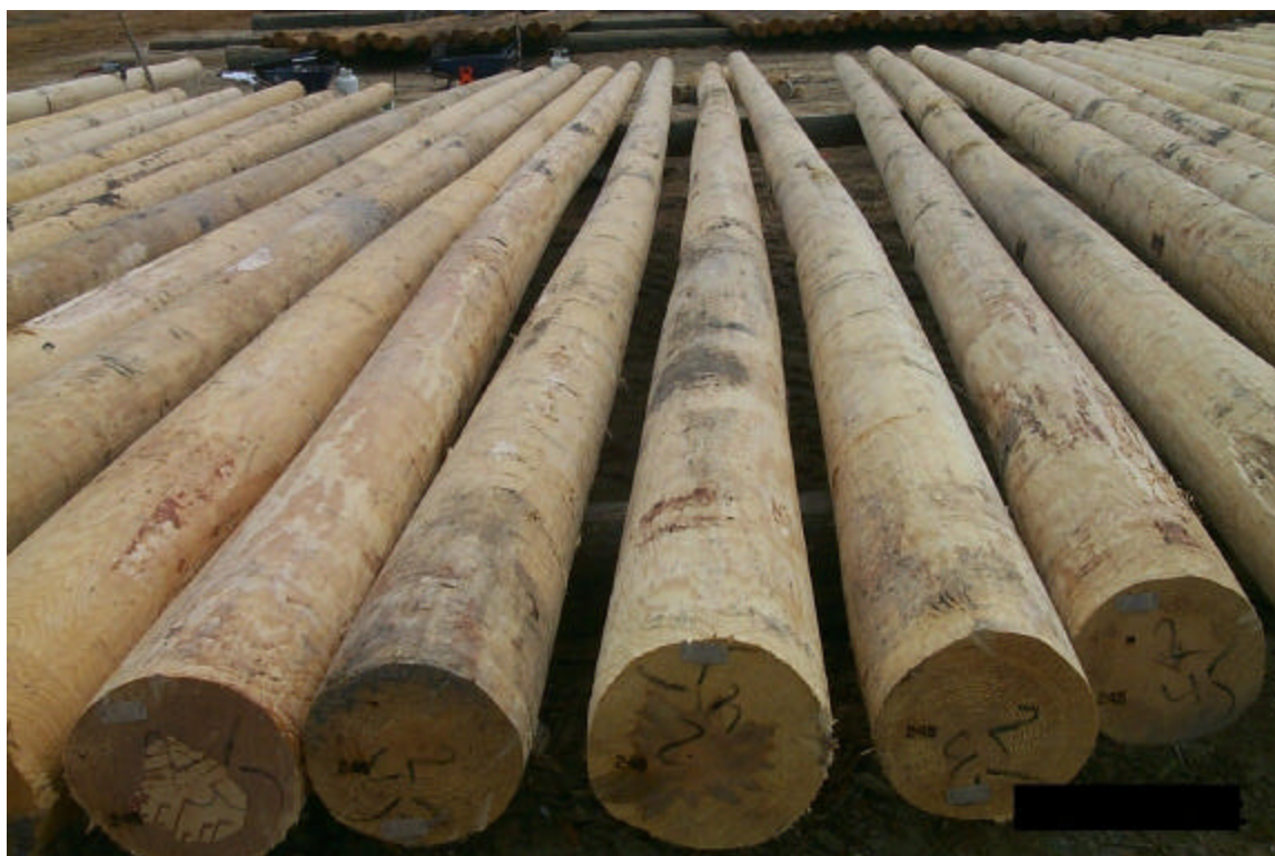
Photo 10. Pine poles at a plant in Vidalia, Georgia.

Warnell School of Forestry & Natural Resources Athens, Georgia 30602-2152