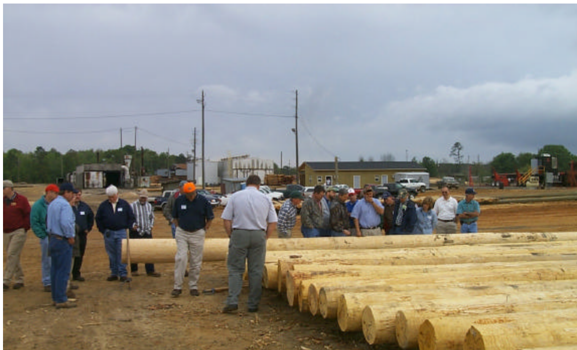
Photo 9. Pine poles at a plant in Vidalia, Georgia.